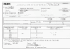
Certificate of inspection

*It is not the type used to obtain calibration certificates.